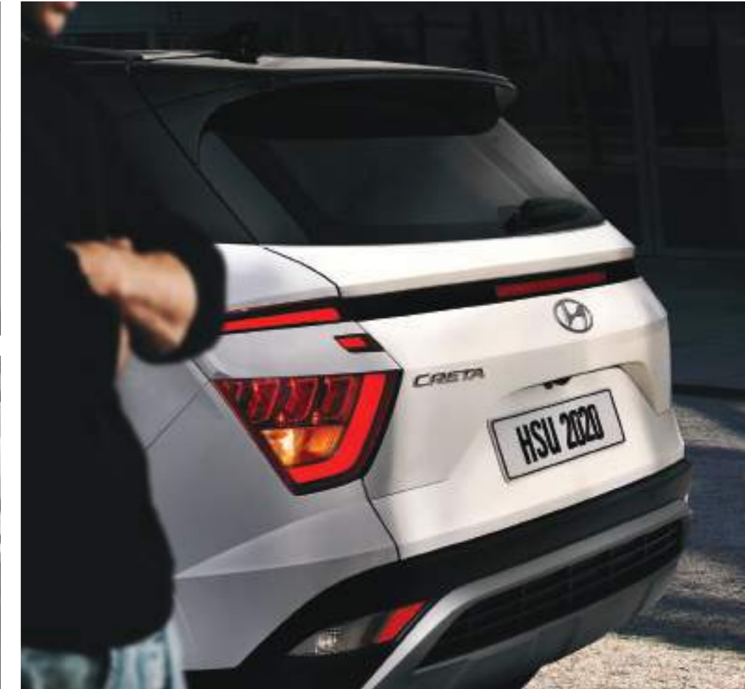
LED rear combination lamps