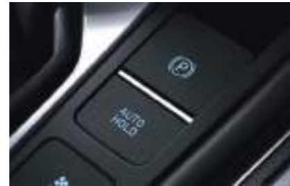
Electric Parking Brake with Auto Hold