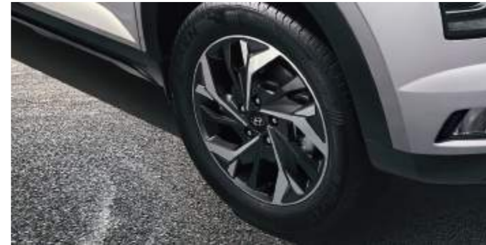
LED headlamps with LED DRLs 17" diamond-cut alloy wheels