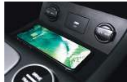
Wireless smartphone charging system