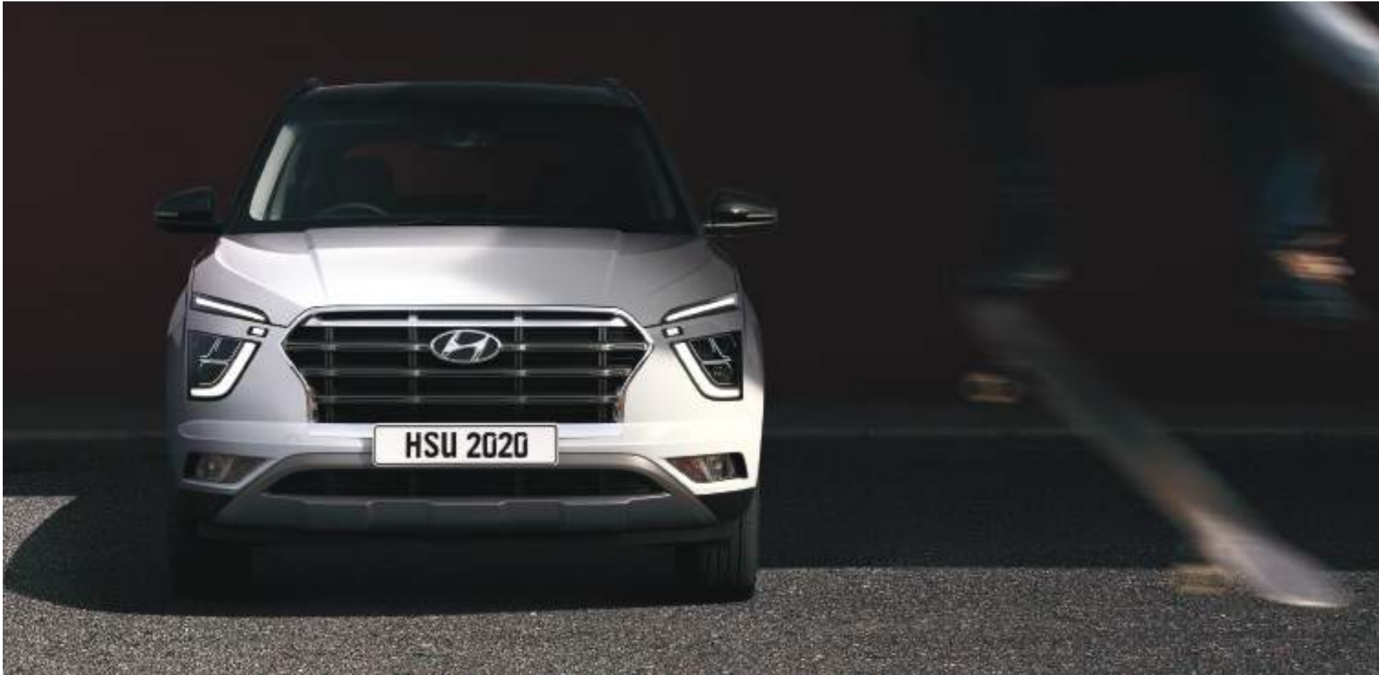
Aero-sculpted front end with signature cascading grille