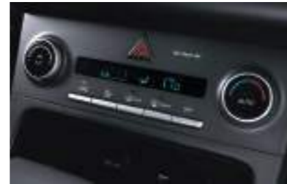
Full automatic temperature controls