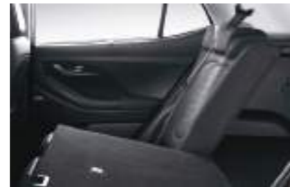
6:4-split rear seats with 2-stage recliner