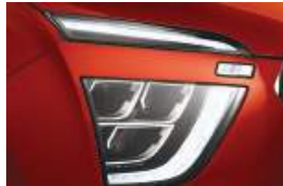
LED MFR headlamps & LED DRLs