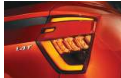
LED rear combination lamps