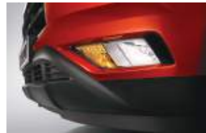
Front fog lamps