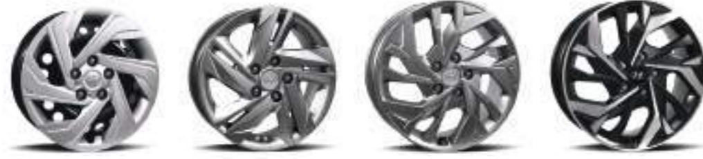
16" steel covers