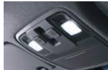
LED personal lamps (Panoramic sunroof only)